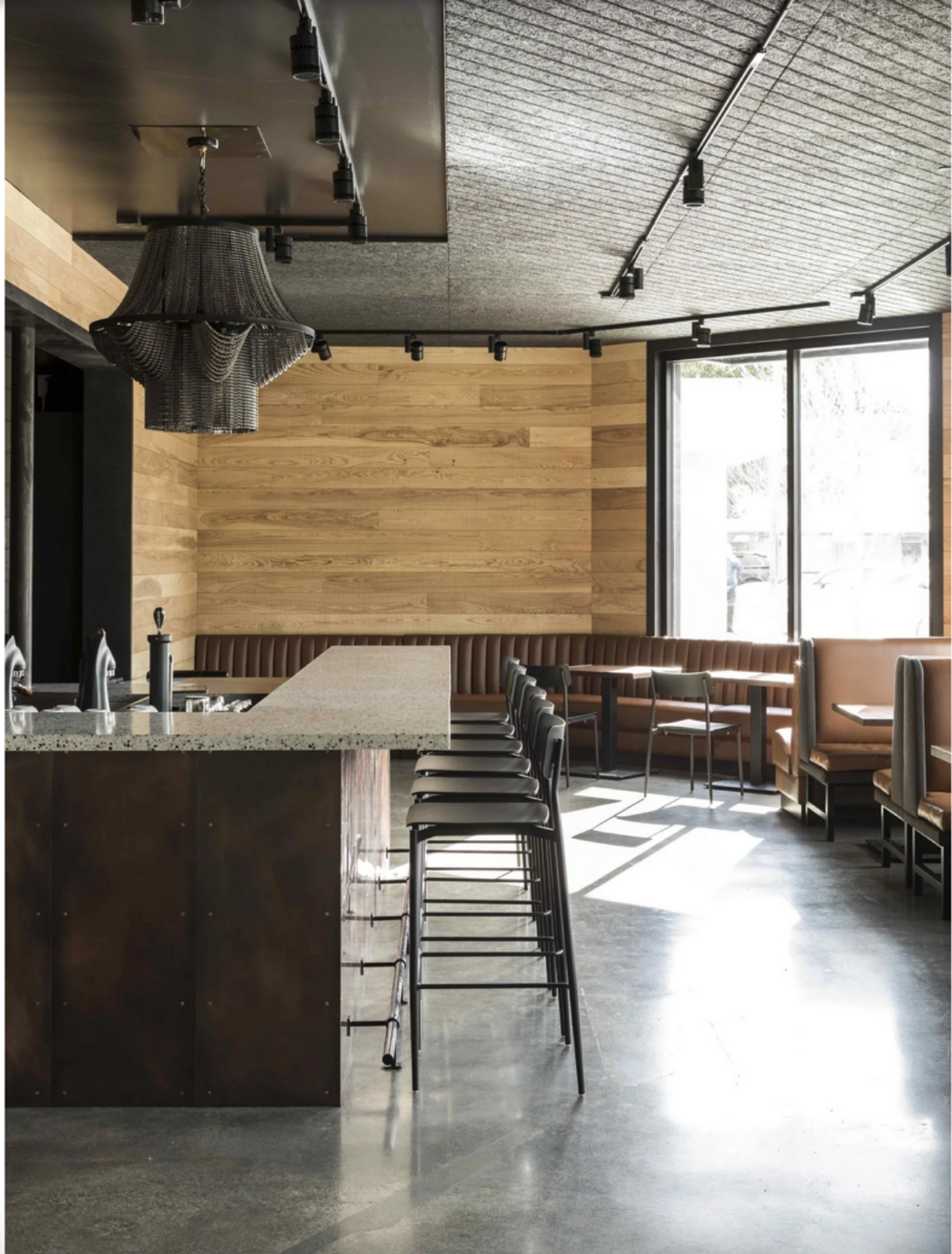
A custom designed retail area supports the front counter with its high customer turnover. Interior details include a copper-paneled water station, copper wall panels with exposed riveting and ash walls. The floor is the original concrete that has been highly polished.